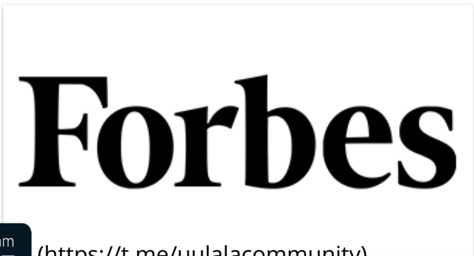
( https://t.me/uulalacommunity ) (single-post.html)